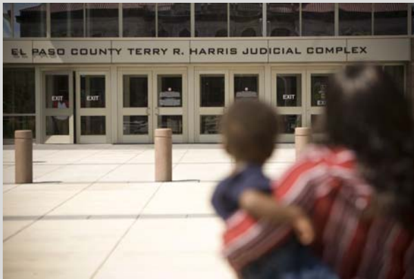
Mother and child